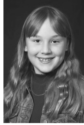
Piper Wilkinson Matilda Wormwood